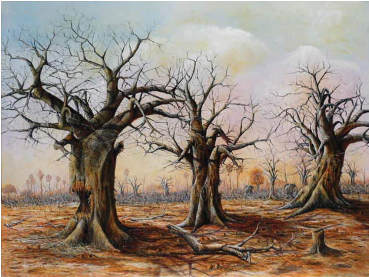
The Spirits of the Valley - oil painting by Will Maberly

“It is time to take the joy of moving even just one life forward, knowing that each one cascades out in a powerful effect that will make a difference.” - Marcia Shafer